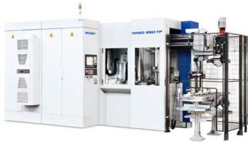
Raso 250 TP